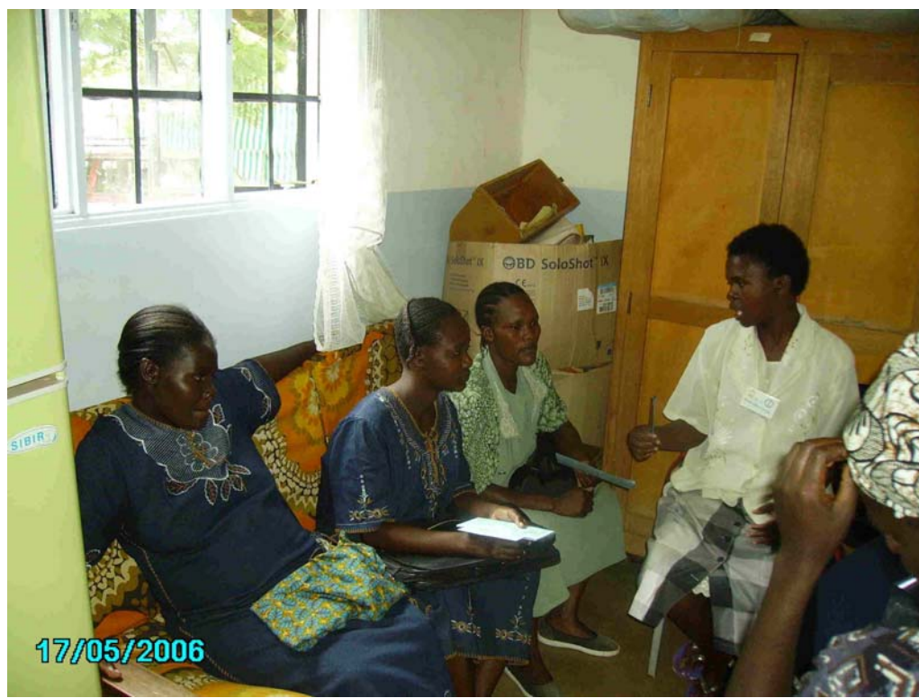
Antenatal clinic peer educator