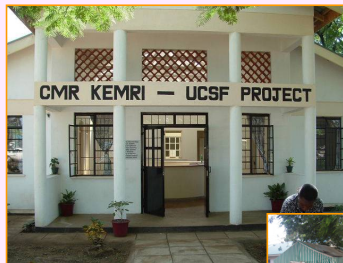
Building housing FACES activities; Inset: FACES tents