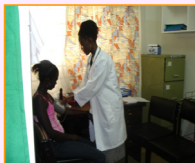
Tuungane clinician attends to a patient