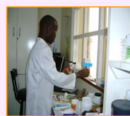
A pharmacist packing drugs for Tuungane at the FACES clinic