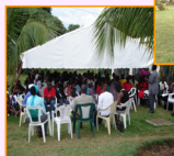
Support group meeting