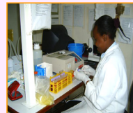
FACES Lab Tech processing samples from Tuungane

"Being counseled by someone my age and who is positive and on ARVs is the best thing about Tuungane" 19-year old female client