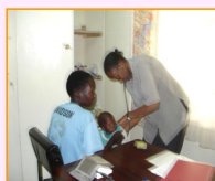
FACES clinician attends to a child at Tuungane