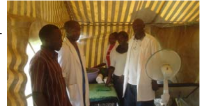
Voluntary Medical Male Circumcision team at Migori District Hospital

The FACES Voluntary Medical Male Circumcision team, together with the local Ministry of Health, recently participated in the Rapid Results Initiative (RRI) in Migori and Rongo districts. The RRI sought to help reduce the HIV burden by heavily promoting and conducting voluntary medical male circumcisions between November 9 and December 20, 2009 throughout Nyanza Province. In Migori and Rongo districts, 3,117 male circumcision procedures were performed during this brief window of time. Overall, the RRI resulted in 35,628 procedures in Nyanza, surpassing the 30,000 RRI target.