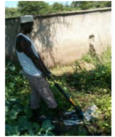
Shamba Maisha participant using the Kickstart Moneymaker irrigation pump

impacted by poverty and poor nutrition. We hope that providing a sustainable farming project will allow the entire household to benefit from improved access to food and income.