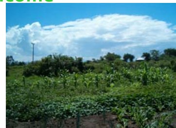
A Shamba Maisha farm outside of Kisumu

At the end of one year, we found that the average Shamba Maisha farmer doubled his or her annual income. As expected, the largest increase was in irrigated income, or income derived from crops they could now irrigate using the pump. Cont. on page 2