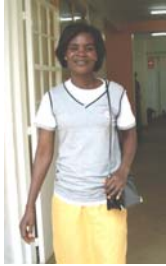
Female FACES patient feeling too happy

How has your life changed since you started receiving HIV care and treatment?