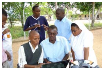
FACES Systems Team at Kadem TB Health Centre in Migori.

Youth & adult males: 7368 Infant males: 30