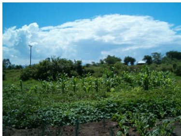
Shamba Maisha farm

The FACES team is currently seeking funding to test Shamba Maisha as a pilot program in one health facility. If Shamba Maisha is as successful as expected, we hope to expand to more facilities in three years time.