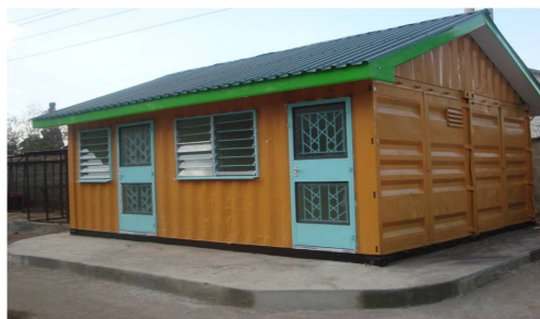
Nairobi office and reception renovations

FACES Nairobi clinic is sporting new administration and data offices, as well as a new patient reception area and a refurbished patient waiting bay. Shipping containers were resourcefully and artfully turned into beautiful, sturdy, and roomy offices. Renovation was also conducted at Nairobi's sister clinic in town, Mimosa. A shipping container was converted into a very functional clinic facility which will allow for extended HIV clinic hours at that location.