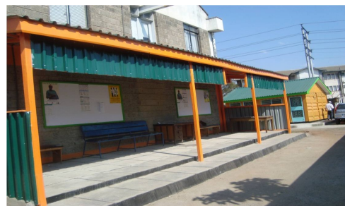
Nairobi patient waiting bay renovation